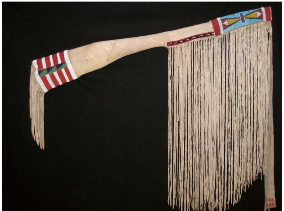
1875 Crow Beaded Hide Rifle Scabbard, ▶ Trade Cloth, Long Fringe, 45"