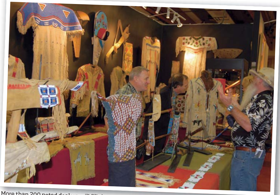
More than 200 noted dealers will fill the Marin Civic Center in San Rafael for the 26 th annual Marin Show: Art of the Americas .

Beginning this year the Marin Show and San Francisco Tribal & Textile Arts Show are anchor events for the first Tribal Arts Weekend, one of the legs of the debuting Arte du Monde , a weeklong celebration of cultural arts in the Bay Area. Tribal Arts Weekend will be one of the largest and most significant gatherings of Tribal Arts dealers and collectors in the world, and visitors will gain admission to both shows with the purchase of one ticket ($15) at either