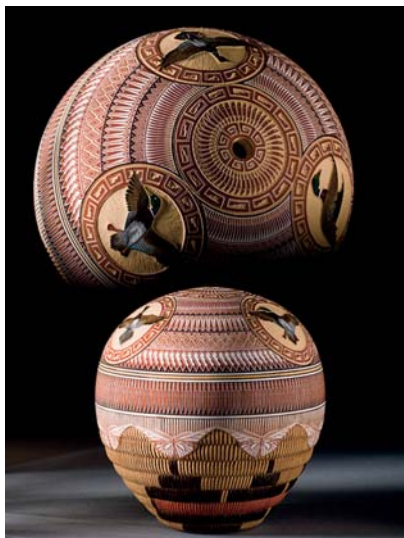
Soothing the Soul , ceramics and natural clay, 3¾ x 4½", by Wallace Nez.