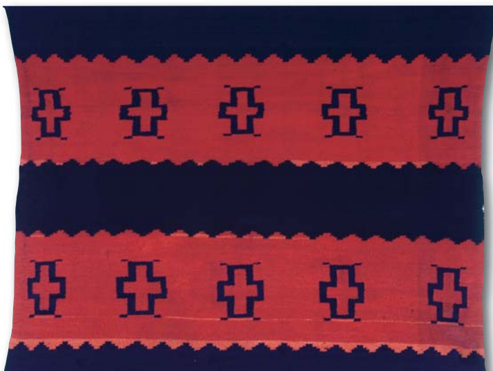
Late classic Navajo Manta, c.1865-68, 41 x 48"